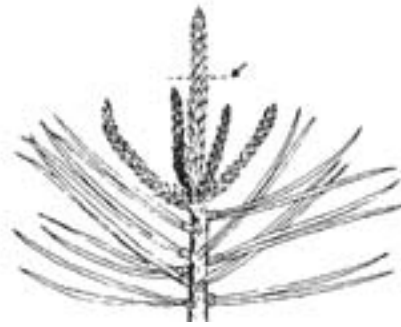
Figure 3. On pines, for bushier new growth pinch growing tips by snapping off 1/3 of the “candle” tips with fingers. Since pines produce few side buds, they are intolerant of more extensive pruning.

While shearing is quick and easy, it is not recommended, especially after mid-summer. Shearing creates a dense growth of foliage on the plant’s exterior. This in turn shades out the interior growth and the plant becomes a thin shell of foliage. Frequently sheared plants are more prone to show needle browning and dieback from winter cold and drying winds.