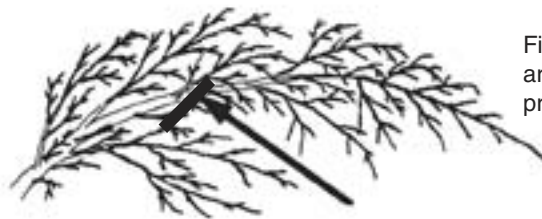
Figure 4. Pruning junipers and arborvitae back to a side shoot hides the pruning cut.

While shearing is quick and easy, it is not recommended, especially after mid-summer. Shearing creates a dense growth of foliage on the plant’s exterior. This in turn shades out the interior growth and the plant becomes a thin shell of foliage. Frequently sheared plants are more prone to show needle browning and dieback from winter cold and drying winds.