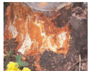
Figure 3: White fungal fans of Armillaria spp.

Armillaria spreads along roots and by rhizomorphs (fungal-root-like structures). One tree or a group can be attacked. The fungus can subsist on dead, woody material for more than 35 years. Armillaria prefers to infect trees that are already stressed by environmental factors or other pathogens. It prefers moist sites and moderate temperatures and is rarely found on extremely hot, cold or dry sites.