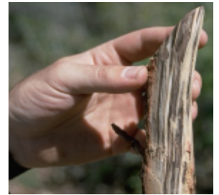
Figure 1: Vertical staining from black stain root disease.

This vascular disease causes extensive black staining of the sapwood in the root and lower stem before killing the sapwood. Bark beetles tend to follow as secondary pathogens and eventually cause the death of the tree. Spread occurs through root grafts and root contacts, and by insects that carry the spores (reproductive structures of the disease). Affected trees usually are in a group.