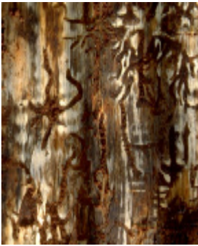
Figure 6: Ips galleries on pinyon.

and silk produced by the larvae. Larval feeding over the summer causes most of the damage. Generations take one to two years.