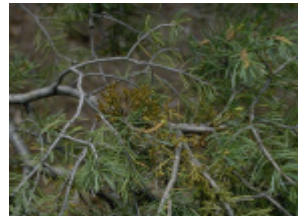
Figure 2: Dwarf mistletoe broom and plants.

These are small, leafless, parasitic flowering plants that grow on branches and spread only to other pinyon pines. They kill slowly by robbing the tree of its nutrients and water. Reproduction occurs when sticky seeds explosively discharge from the plant and adhere to the branches and needles of their next host. The life cycle from germination to dissemination is six years. This relatively slow rate of spread allows time for appropriate action.