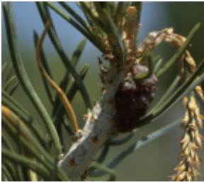
Figure 7: Pinyon tip moth.