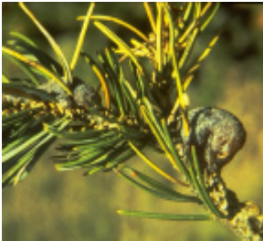
Figure 8: Pinyon pitch nodule moth.

mine the pith of the terminal growth, causing more damage as they grow. Large larvae move on to new tissue, cones or shoots. Pupation occurs inside the terminals and cones. Adults lay eggs from late June through August. There is one generation per year.