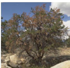
Figure 4: Erratic branch mortality of pinyon decline.