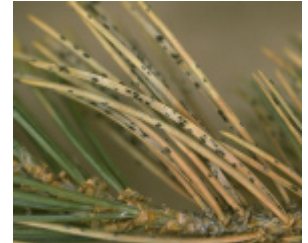
Figure 9: Pinyon needle scale.

Females overwinter on the needle as a legless nymph that resembles a small black bean. Development into the mobile adult form resumes in the spring. Mating occurs in early April. Eggs are laid in masses around the collar, branch crotches and underside of larger branches. The eggs are covered by a white, cottony wax. Newly hatched nymphs settle on the previous year's needles. Second stage nymphs form in late summer and overwinter on the needles. There is one generation per year.