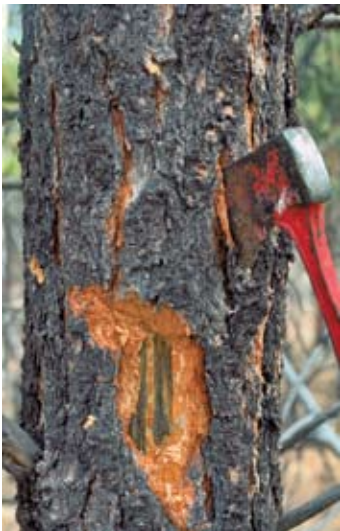
Figure 7: Checking beneath the bark for MPB. This attack was successful (note tunnels and stain).