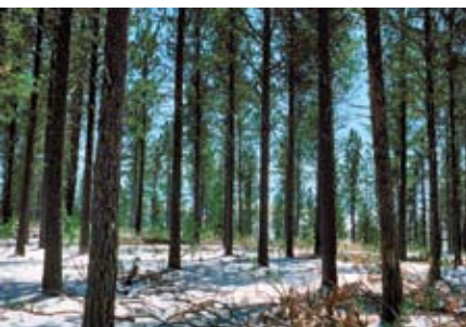
Figure 11: The appearance of a forest thinned to help prevent MPB. This can also improve mountain views and reduce fire hazard.

pine beetle, leading to early reports that “MPB is flying.” Be sure to properly identify the beetles you find associated with your trees.