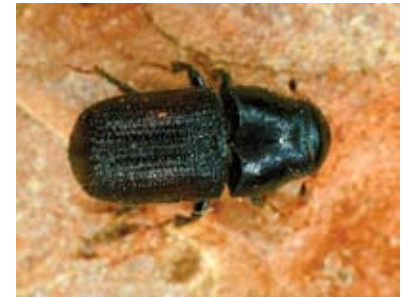
Figure 3: Top view of adult MPB (actual size, 1/8 to 1/3 inch).

Mountain pine beetle has a one-year life cycle in Colorado. In late summer, adults leave the dead, yellow- to red-needled trees in which they developed. In general, females seek out large diameter, living, green trees that they attack by tunneling under the bark. However, under epidemic or outbreak conditions, small diameter trees may also be infested. Coordinated mass attacks by many beetles are common. If successful, each beetle pair mates, forms a vertical tunnel (egg gallery) under the bark and produces about 75 eggs. Following egg hatch, larvae (grubs) tunnel away from the egg gallery, producing a characteristic feeding pattern.