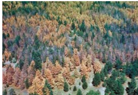
Figure 4: Mountain area infested by MPB, showing three years of mortality. Old, dead trees are gray; newly killed trees are straw yellow or orange. Some trees may also be infested but do not turn color until nine months or so under attack.

MPB larvae spend the winter under the bark. Larvae are able to survive the winter by metabolizing an alcohol called glycerol that acts as an antifreeze. They continue to feed in the spring and transform into pupae in June and July. Emergence of new adults can begin in mid-June and continue through September. However, the great majority of beetles exit trees