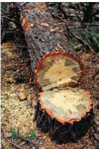
Figure 9: Cut tree killed by MPB, showing the characteristic blue-staining pattern.