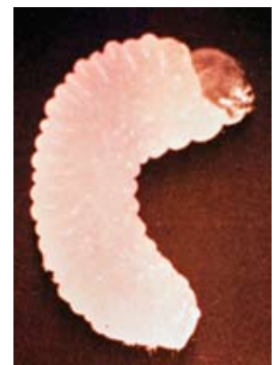
Figure 5: Larva of MPB (actual size, 1/8 to 1/4 inch). They are found under the bark in tunnels.