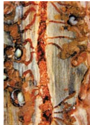
Figure 8: Characteristic tunnels (galleries) of mountain pine beetle made by the adults and larvae. The underbark area looks like this in late spring. Bluestained wood is caused by fungi the beetles introduce.

An important method of prevention involves forest management. In general, MPB prefers forests that are old and dense. Managing the forest by