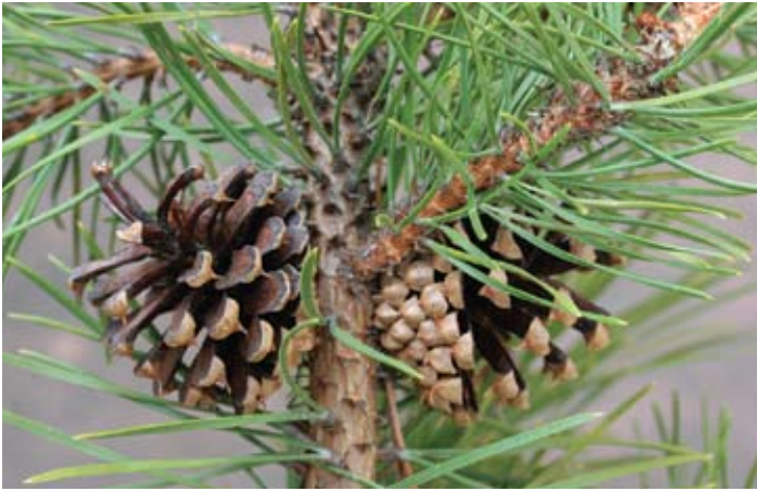
Non-serotinous lodgepole pine cone.

adequately to release seeds, and seeds previously released from non-serotinous cones may exist in the forest litter. However, the role of serotinous and non-serotinous cones as seed sources, and the effect of cone serotiny on subsequent stand density, are not well understood.