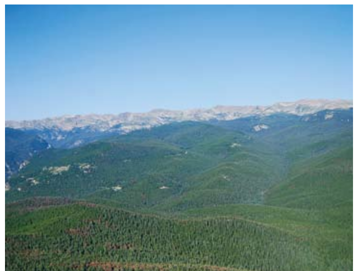
Pure lodgepole pine forest.

Pure lodgepole pine forests may occur where environmental conditions are poorly suited for other tree species, or where human impacts such as logging followed by burning eliminate other species. Lodgepole pines are tolerant of cold, dry conditions and poor, rocky soils. Individuals rarely live more than 400 years. Typically, pure lodgepole pine stands result after stand-replacing fires have killed all or most trees, leaving behind lodgepole seeds stored in serotinous cones as the only significant seed source. Alternatively, fire-killed stands without serotinous cones may still reproduce if lodgepole pine seeds are blown in from unburned trees nearby. Stand-replacing fires may occur in healthy, green forests under extreme weather conditions. Similar fires might occur under more moderate conditions when mountain pine beetle mortality or mistletoe infestation in stands creates additional dry fuels, though there is no firm evidence thus far confirming this. Pure lodgepole pine stands are often established within a few years after the fire and have one dominant age class or cohort for the life of the new stand, although some stands may develop continuously over longer periods of time and have multiple age classes. However, if aspen is present even in small amounts before large fires, its sprouting capability may lead to aspen patches which often give way over time to slower-growing lodgepole pine.