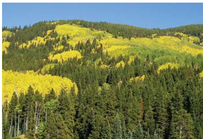
Aspen mixed with lodgepole.

Mixed conifer forests at lower elevations (usually between 7500 and 9000 feet elevation) often include lodgepole pine along with ponderosa pine, Douglas-fir, aspen, and perhaps small amounts of subalpine fir, Engelmann spruce, and limber pine. Large stand-replacing fires can occur in mixed conifer forests and may lead to pure lodgepole pine stands. More typically, however, mixed-severity fires create smaller openings providing opportunities for patches of lodgepole pine establishment and persistence within the complex landscape mosaic of mixed conifer. Once again, aspen may become temporarily dominant if it existed prior to the fire.