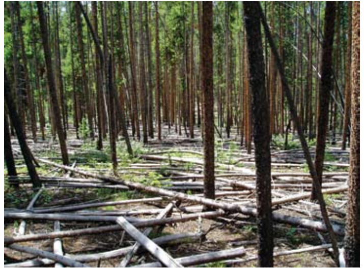
Downed lodgepole pine in Grand County, Colo.

Trees killed by mountain pine beetle may remain standing for a number of years, but as they progressively decay and fall to the ground (often aided by wind), the fuel structure changes once again. In this phase (typically 10-20 years or more after death), a large amount of biomass becomes available as fuel within flame heights that can be generated by the fine surface fuels. Some of the biomass is elevated above the ground where it dries out more easily and becomes available to support intense fire with a large release of heat. Such a fire is relatively hard to control and nearby structures may be hard to protect. Furthermore, fire intensities under these conditions could cause high mortality of young trees that survived or regenerated after the mountain pine beetle attack. If widespread fire mortality occurs before trees have matured to cone production age, rapid re-establishment of lodgepole pine on this site is less likely.