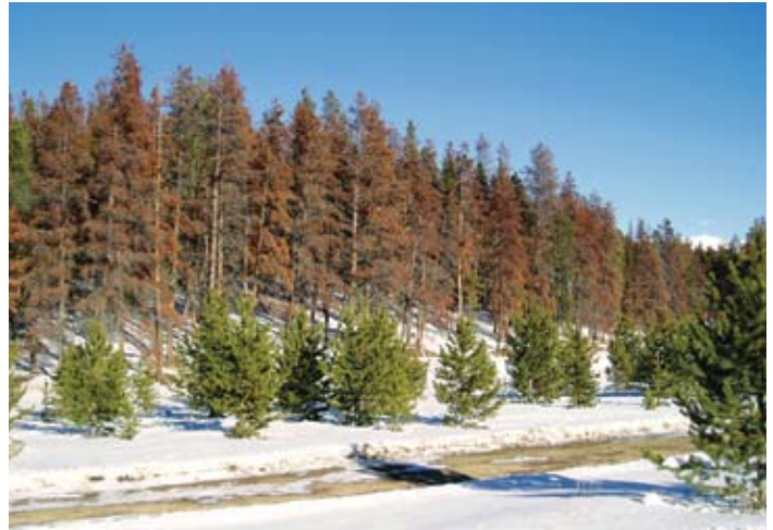
Lodgepole regeneration in Grand County, Colo.

Recovery of lodgepole pine forests following previous beetle outbreaks suggests, however, that in many places significant numbers of lodgepole seedlings and small saplings will survive. These may produce new pure stands of lodgepole pine if no other species are present, or help sustain a lodgepole component in stands of mixed species. Height growth of Engelmann spruce or subalpine fir seedlings is slow compared with that of lodgepole seedlings. Where small seedlings of spruce or fir existed beneath a pure lodgepole pine overstory, lodgepole pine may still predominate