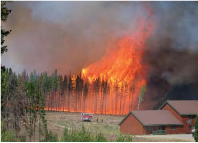
Fire at the YMCA camp, Snow Mountain Ranch, in Grand County.

these forests, attesting to their low probability of an intense crown fire except under extreme weather conditions.