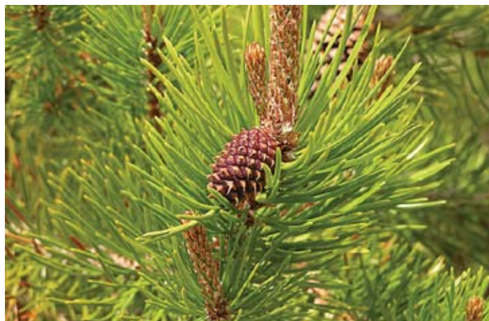
Serotinous lodgepole pine cone.

Many lodgepole pine trees have serotinous cones that remain closed and store viable seeds in the crowns of trees for years, actually requiring the heat of a fire for seed release and dispersal. When crown fires kill trees, the resin sealing the cones melts, allowing the cones to open shortly after the fire. Huge numbers of seeds are released at once to the forest floor, falling on exposed soil that is an excellent seedbed for germination and seedling establishment. It is not uncommon to find 50,000 or more seedlings per acre several years after a stand-replacing fire. Competition then thins out trees naturally as these young forests grow to maturity. After a mountain pine beetle epidemic, lodgepole pine stands also generally regenerate, because serotinous cones on branches that have fallen near the ground heat