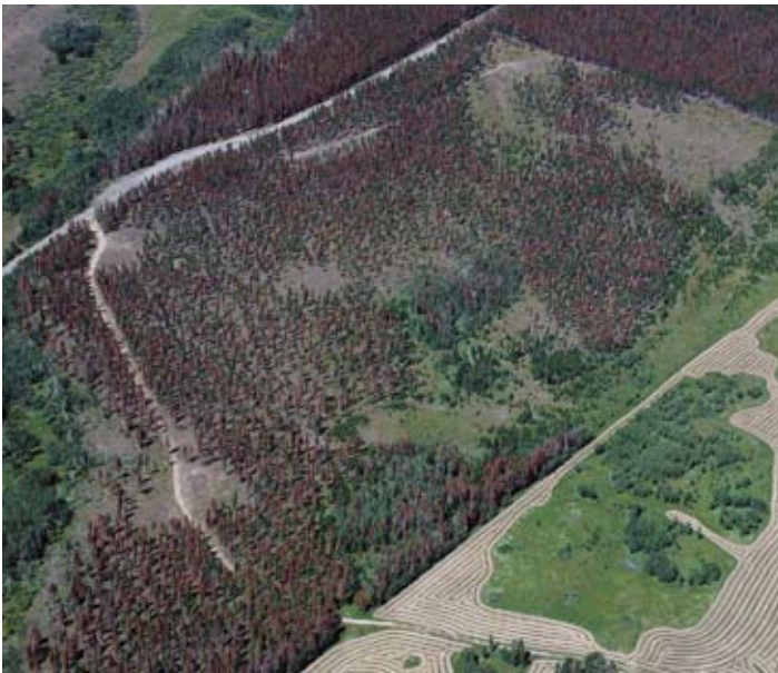
Thinning practices near the State Forest, did not halt MPB infestation.

Preventive spraying of high-value trees with insecticides is effective in protecting trees from bark beetle attack. Direct control measures such as removing infested trees may provide some mitigation on a small local scale but are not effective at a landscape scale.