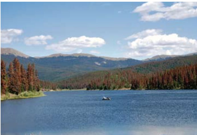
Mountain pine beetle in lodgepole pine near Michigan Reservoir.

Major lodgepole pine forest changes and how they affect us. Mountain pine beetle populations have reached outbreak levels in lodgepole pine forests throughout North America. The geographic focus of this report centers on the southern Rocky Mountains of Colorado and southern Wyoming. The epidemic extends much more widely, however, from the southern Rocky Mountains in Colorado in the United States to the northern Rocky Mountains in British Columbia and Alberta, Canada.