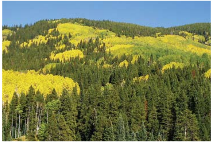
Aspen mixed with lodgepole.

Mixed conifer forests at lower elevations (usually between 7500 and 9000 feet elevation) often include lodgepole pine along with ponderosa pine, Douglas-fir, aspen, and perhaps small amounts of subalpine fir, Engelmann spruce, and limber pine. Large stand-replacing fires can occur in mixed conifer forests and may lead to pure lodgepole pine stands. More typically, however, mixed-severity fires create smaller openings providing opportunities for patches of lodgepole pine establishment and persistence within the complex landscape mosaic of mixed conifer. Once again, aspen may become temporarily dominant if it existed prior to the fire.