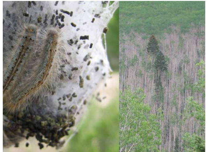
Figure 2. Forest tent caterpillars form webbed nests in aspen trees, and during major outbreaks can defoliate entire canopies in early summer. Aspen usually survive even severe defoliation, although several years of caterpillar outbreaks will kill some trees.