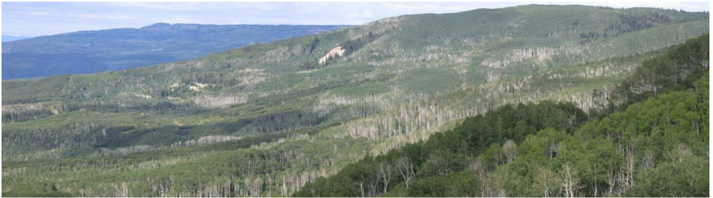
Figure 3. Death of many century-old aspen trees is changing the appearance of some Colorado landscapes