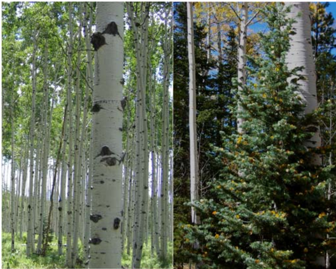
Figure 1. Some stands have few conifer trees, and aspen trees remain dominant for a century or more (left). Other stands have large numbers of conifer trees establishing, reducing the number of new aspen trees and gradually leading to conifer dominance. Both types of aspen forests are common in Colorado.

Aspen trees commonly live for more than 100 years, with the oldest trees reaching 200 or more years. Forests with large numbers of conifers mixed with aspens will shift to conifer dominance, often around 75 or 100 years after the last major disturbance. More than 95% of Colorado's aspen forests are now older than 80 years, so a large portion of the forests are maturing, or shifting to conifer dominance.