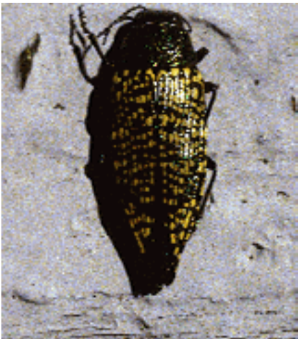
Figure 2: Metallic wood borer.

rarely tunnel extensively enough to cause structural failure. Adult borers found inside the home may look ominous and pinch the skin if handled but are not dangerous.