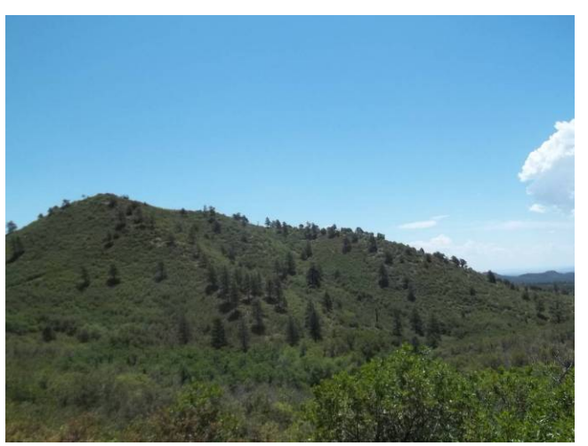
Model 6 / SH2

increase spread rates and intensities and move fire into the tree crowns.