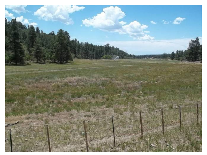
Model 1 / GR1

high. A complicating factor for this fuel model is the level of standing and down dead wood present due to past drought damage and frost-kill in the oak. Down woody fuels exceed 10 tons per acre in some locations. Normal live and dead fuel loads in Fuel Model 6 are 6 tons per acre.