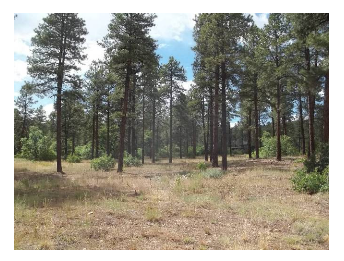
Example Shaded Fuelbreak Density (Edgemont Highlands)

Probability of wildfire moving into or out of Rancho Mira Sol can be reduced through maintenance of shaded fuelbreaks along the boundaries of the subdivision and along the road rights-of-way. The treatment prescription would be similar to Zone 2, i.e., crown spacing of 15 to 25 feet between trees, tree clumps or shrub clumps and pruning of tree branches on trees taller than 25 feet up ten feet. More