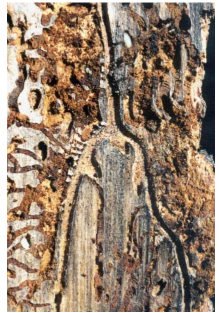
Ips pini egg galleries under bark of ponderosa pine trunk.