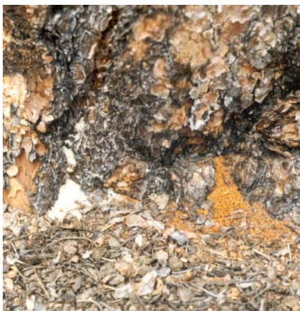
Boring dust at the base of a pine tree. Reddish boring dust is caused by ips beetles. The whitish dust is from ambrosia bark beetles.