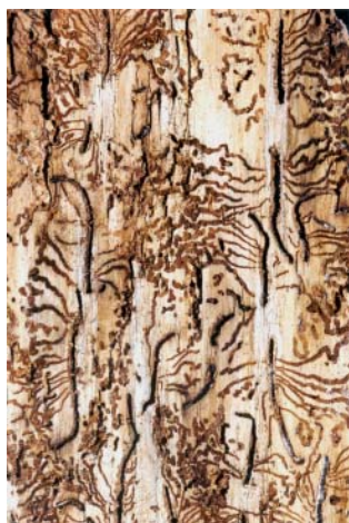
Tunneling by Ips hunteri in blue spruce.

Note: Concentrations of insecticides used to control bark beetles are often considerably greater than those used for insects on foliage. To avoid needle burning, try to limit the application to the bark, particularly when using liquid (emulsifiable concentrate) formulations that have increased risk of causing plant injuries.