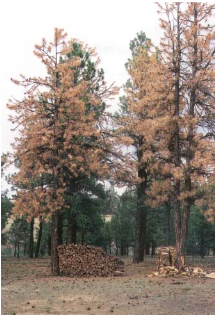
Storing cut firewood near susceptible trees greatly increases the risk of ips beetle attack.