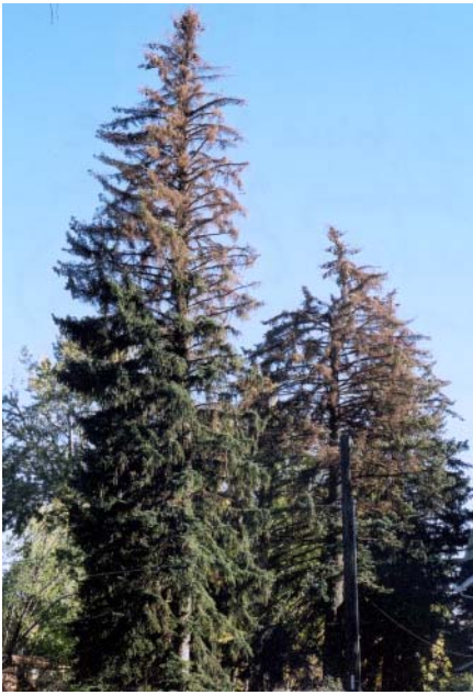
Top dieback of spruce from drought stress and ips attack.