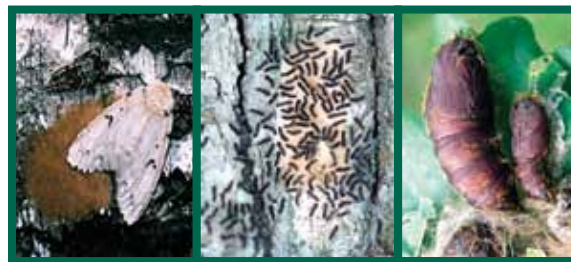
Left: Female with egg mass 6 Center: Larvae emerging from egg mass 7 Right: Pupae 8