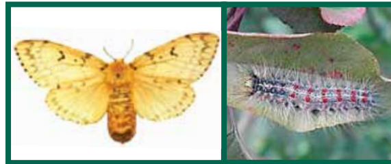
Left: Adult female 4 Right: Late instar larva 5