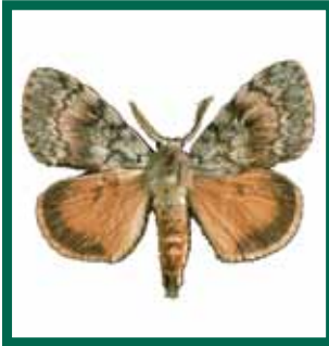
Gypsy moth - adult male. 3

The gypsy moth (GM) is one of North America's most devastating forest pests, feeding on over 100 species of trees and plants. The European GM was introduced in the late 1860s to