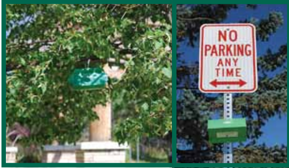
GM traps in a tree 9 (left) and on a road sign 10 (right)