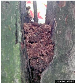
Figure 4. Asian longhorned beetle frass in tree crotch.