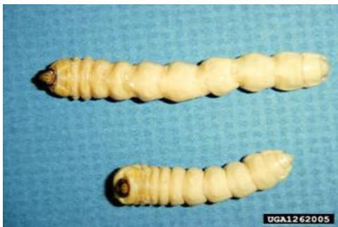
Figure 1. Asian longhorned beetle larvae.