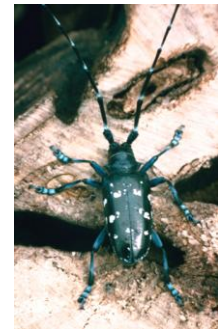
Figure 6. Asian longhorned beetle adult.

The larvae of the Asian longhorned beetle (Figure 1 and 7) are soft-bodied, creamy white in color, and have a hard brown head capsule. Mature larvae may reach 2 inches in length. The larvae would be found deeply tunneling the heartwood of hardwood trees. Larvae of the Asian longhorned beetle are not readily distinguishable from other longhorned beetle larvae (roundheaded borers) that occur in Colorado.