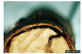
Figure 9. Asian longhorned beetle larva tunneling damage through heartwood.