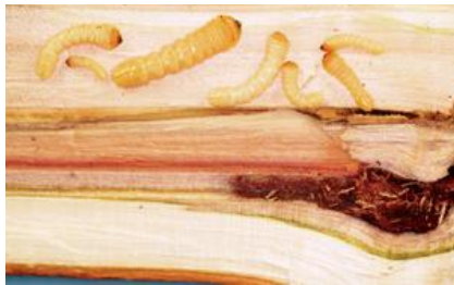
Figure 7. Asian longhorned beetle larvae.