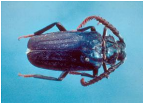
Figure 14. Prionus beetle.

Prionus beetles. There are seven species of large root boring beetles in the genus Prionus that are known to occur in Colorado ( Prionus californicus , P. heroicus , P. fissicornus , P. emarginatus , P. integer , P. palparis , P. rhodocerus , and P. imbricornis ).