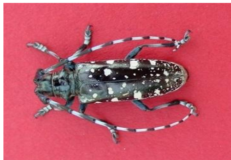
Figure 2. Female Asian longhorned beetle.

The Asian longhorned beetle (ALB), Anoplophora glabripennis , is a wood boring beetle of Asian origin that was first detected in Brooklyn in 1996. Two years later a separate infestation was found in the Chicago suburbs. The Asian longhorned beetle has the potential to be very damaging to certain types of hardwood trees, causing tree decline and even death. Many native trees are susceptible to this insect and there are concerns that it could seriously affect natural forest systems as well as shade trees.