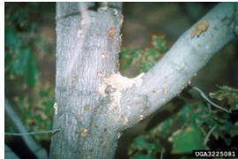
Figure 5. Asian longhorned beetle boring dust.

Despite major effort that continues, to date there are no highly effective traps or lures for this insect. Its detection is largely dependent on interested individuals being able to identify adult insects, which fortunately is relatively easy because of the Asian longhorned beetle is conspicuous with readily identifiable features. Suspect insects or suspicious infestations should then be immediately brought to the attention of the Colorado State extension office or Colorado State Forest Service office near the county which the suspect insect(s) were found.