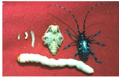
Figure 8. Asian longhorned beetle life stages.