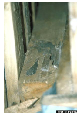
Figure 3. Asian longhorned beetle damage to boards and pallets.

Introduction of Asian longhorned beetle into Colorado most likely would occur via hardwood packing materials (Figure 3) originating from China-shipped goods. In recent years use of these materials has been much more strictly regulated so current shipments are less likely to harbor beetles. However, new introductions remain possible and infestations earlier established may take several years before detection. In Colorado, early identification may likely allow successful efforts to eradicate introductions that do occur, as was earlier demonstrated by the recent elimination of the Chicago-area infestation.