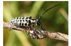
Figure 11. Adult cottonwood borer