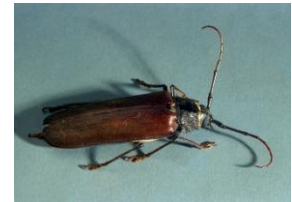
Figure 15. Ergates spiculatus female.

Ponderous borer ( Ergates spiculatus neomexicanus ). Adults of Ergates spiculatus neomexicanus can range from 1 \frac{3}{4} to 2 \frac{1}{2} inches in length and are generally considered to be the largest beetle found in Colorado. Adult beetles are reddish brown in color (head and thorax darker than the elytra) and lack irregular spotting. It occurs in recently killed or felled trees. The solid reddish brown color and very large size of E. spiculatus neomexicanus easily distinguish it from the smaller and irregularly spotted Asian longhorn beetle.