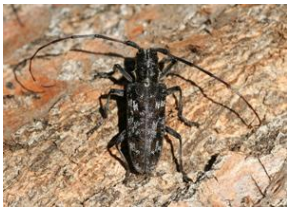
Figure 12. Adult spotted pine sawyer.

Spotted Pine Sawyer ( Monochamus clamator ). Monochamus clamator is the most common pine sawyer found in Colorado and superficially resembles the Asian longhorned beetle in both size and color. The adult beetle is between 3/4 and 1 1/4 inches long and brown in color with irregular bluish-gray spots on the wing covers (elytra) (Figure 12). A prominent toothed area occurs on the sides of the prothorax. The male antennae may be up to 2 1/2 times the length of the body while those of the female are only slightly longer than the body. The spotted pine sawyer is a very common insect that develops in pines that have recently been killed or are under severe stress. One site where it may be seen particularly frequently is in forest areas where mountain pine beetle has caused recent tree mortality.