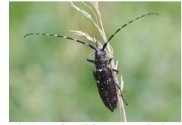
Figure 13. whitespotted pine sawyer adult.

Monochamus scutellatus is a wood boring beetle closely related to the spotted pine sawyer and another common native insect associated with weakened and recently killed conifers. The adult beetle is of similar size, between \frac{3}{4} and 1 inch long. They are perhaps best distinguished by a single small white mark at the base of the wing covers on both males and females. With the exception of the single spot, males are solidly colored shiny-black while female coloration varies.